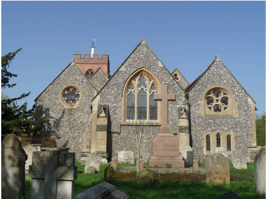
St Mary's roof pitches – and the East window