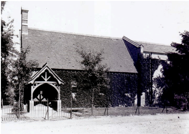
St Martin's Church ~1920