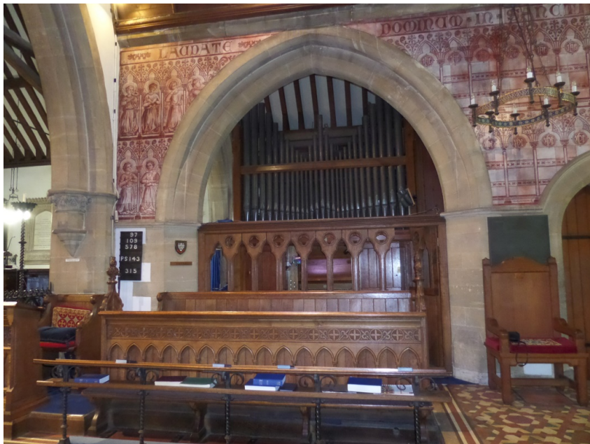
St Mary's organ