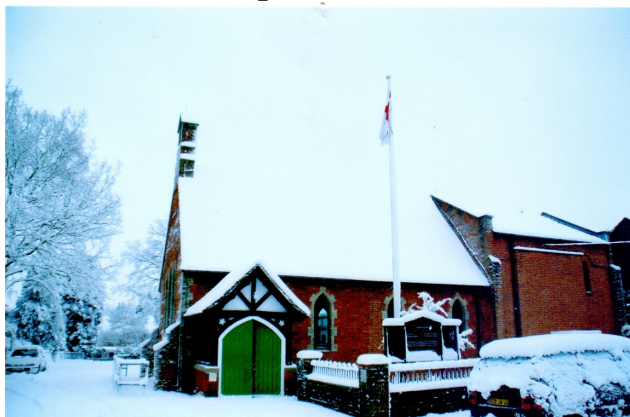
Snow on St Martins